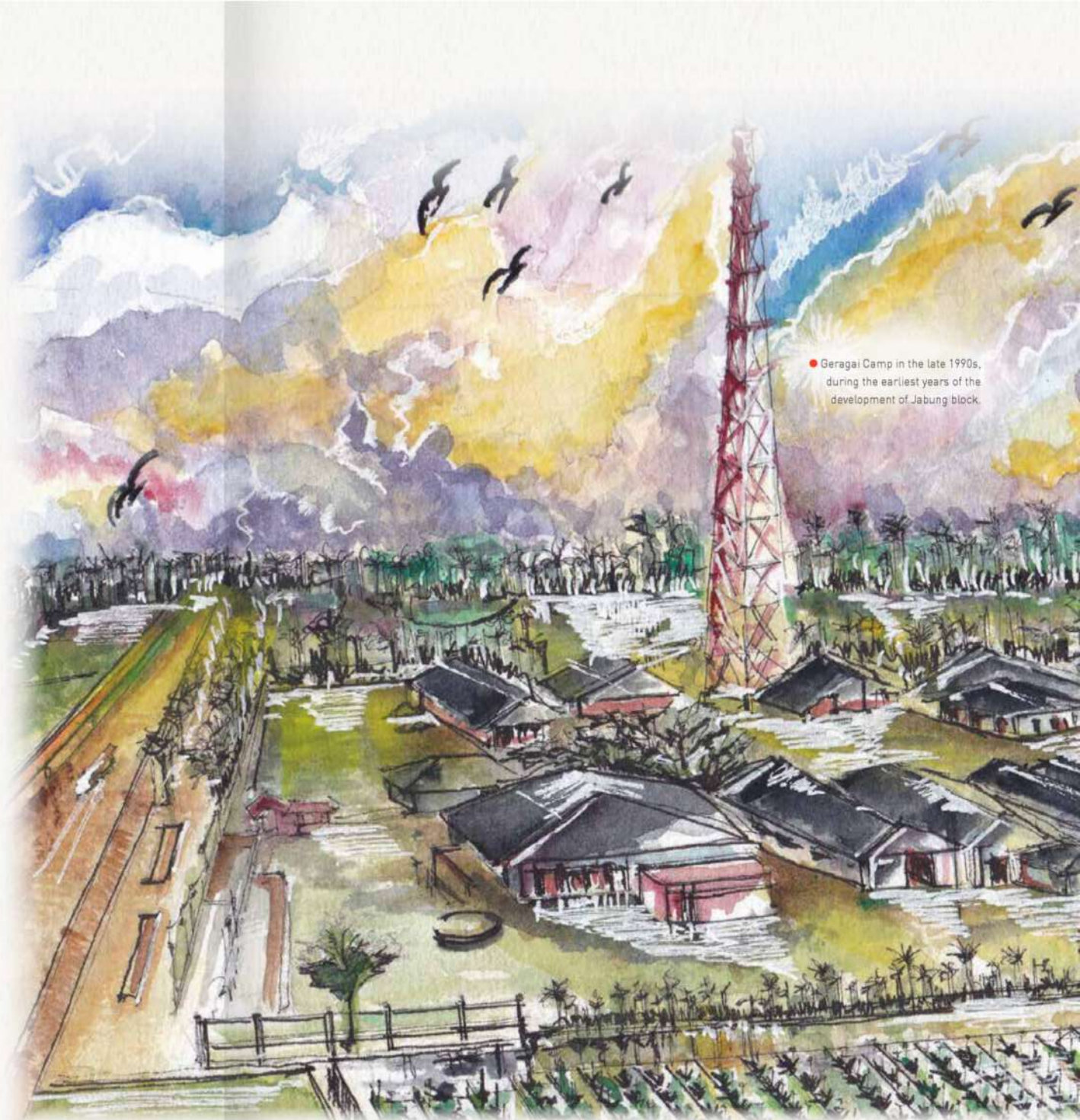
● Geragai Camp in the late 1990s, during the earliest years of the development of Jabung block.