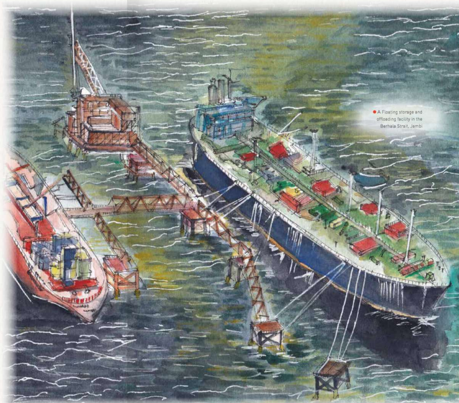
● A Floating storage and offloading facility in the Berhala Strait, Jambi

A giant energy firm, PetroChina has operations in over 30 countries and booked a Top 5 spot in the Fortune Global 500. The company is listed on the stock exchanges in Hong Kong, New York and Shanghai.